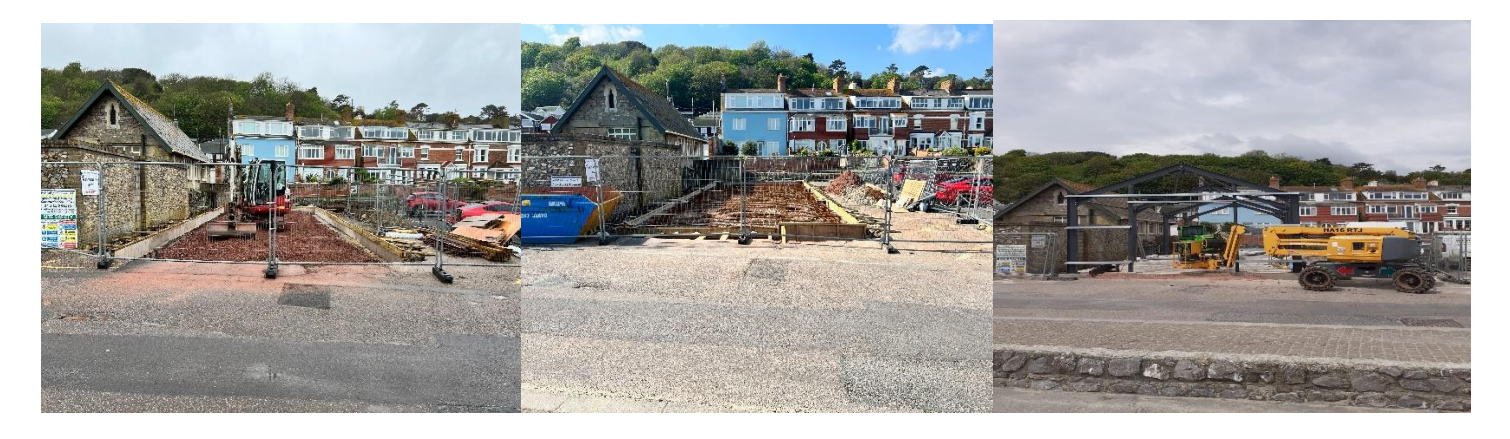
30<sup>th</sup> April 7<sup>th</sup> May 16<sup>th</sup> May

Works started in April and as you can see by the pictures below it is progressing well.